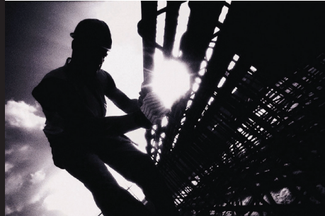
According to the National Cancer Institute, approximately 3,000 cases per year of malignant mesothelioma are being reported in the United States, and the incidence appears to be increasing.

America's history of supporting a strong manufacturing-based economy has a dark side—thousands of people were exposed to asbestos and became sick with a rare form of cancer called mesothelioma.